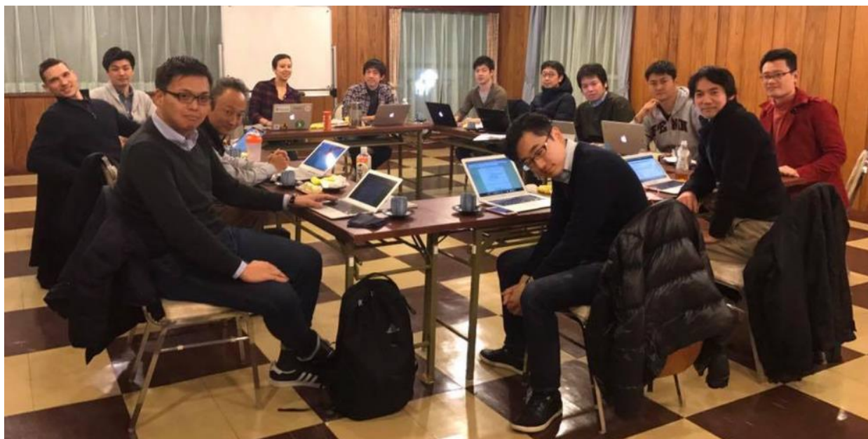
Meeting of the 2 nd generation of the board of directors of Fintech Association of Japan