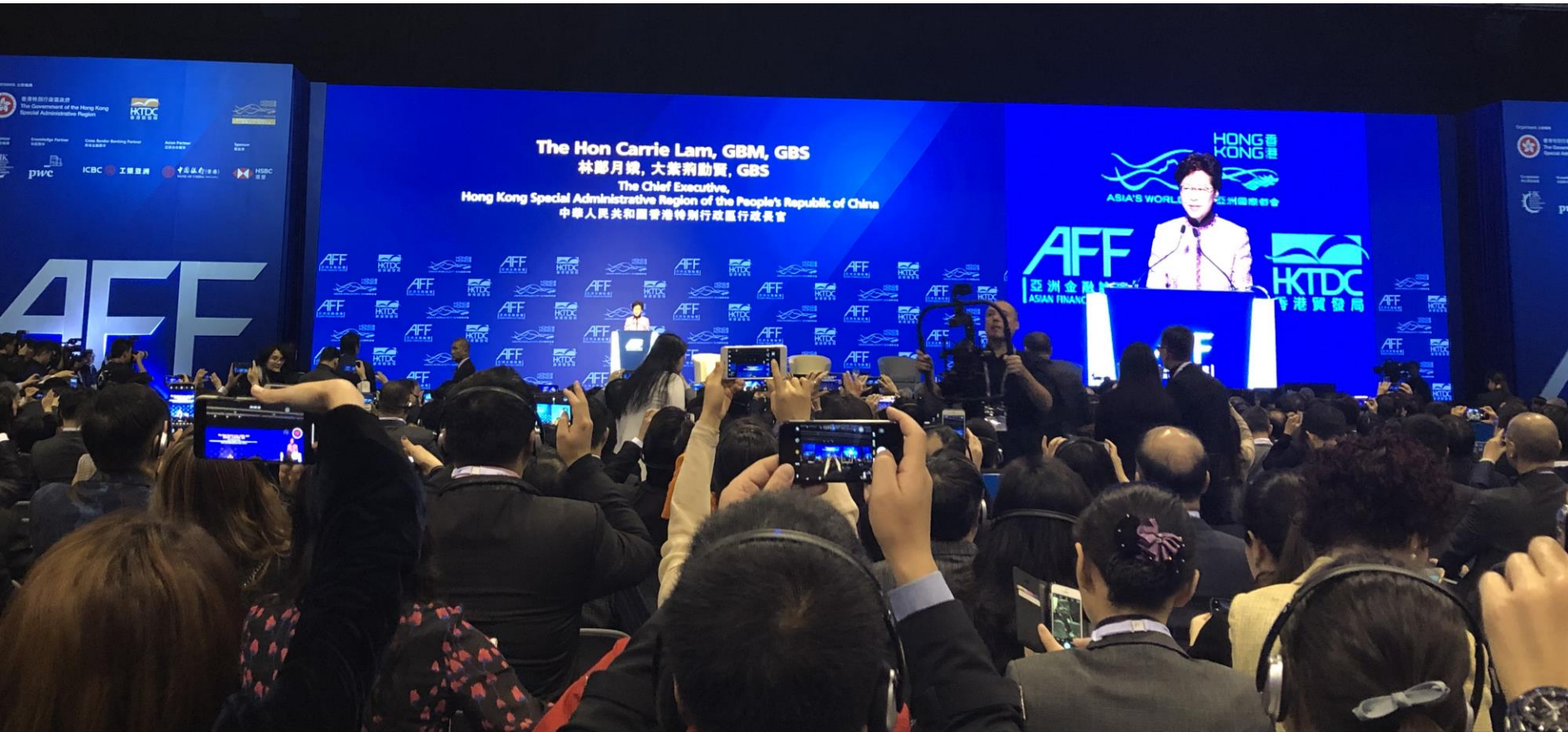
Carrie Lam, 中華人民共和國香港特別行政區行政長官